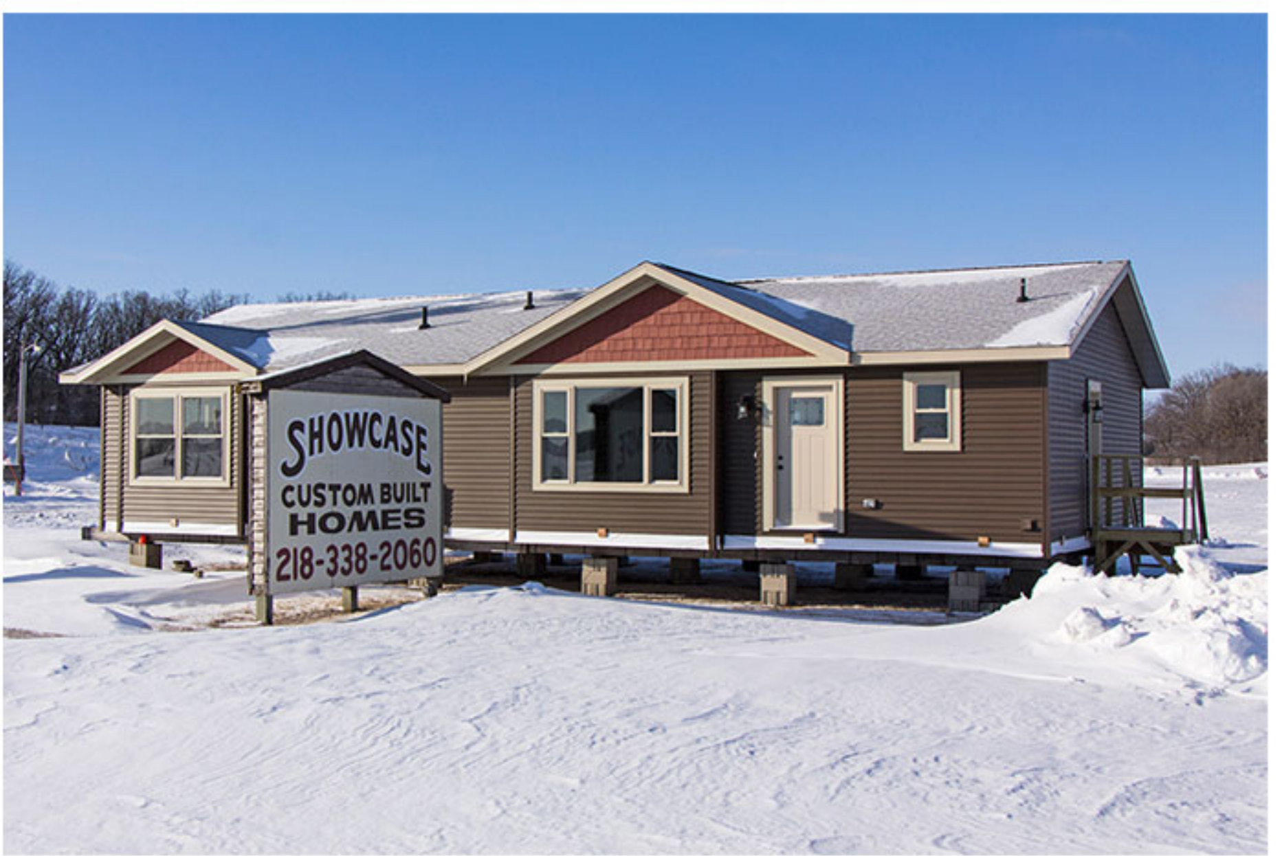
VISIT OUR MODEL HOME - 28' x 54' -1,512 Sq. Feet