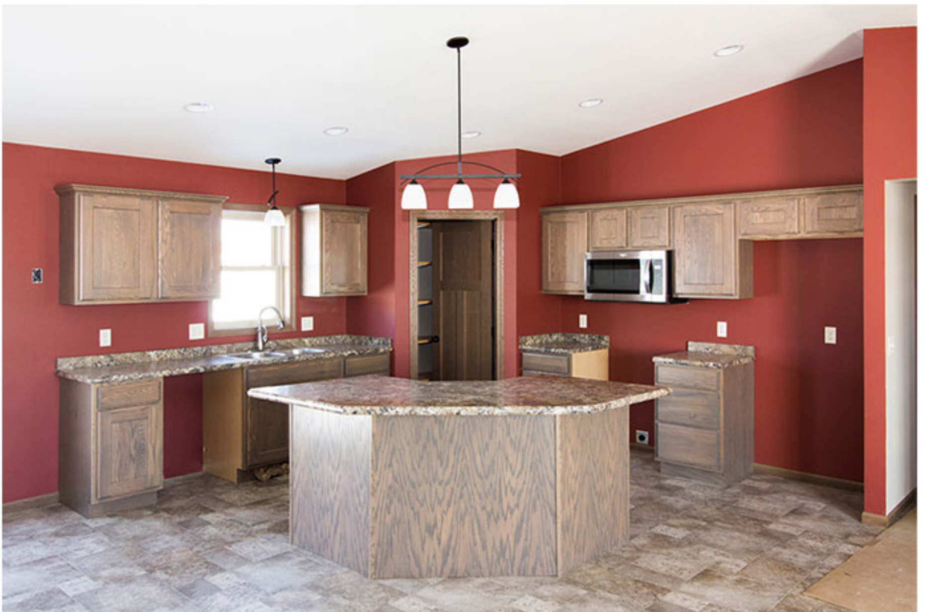
Quality Built - Woodland Cabinetry