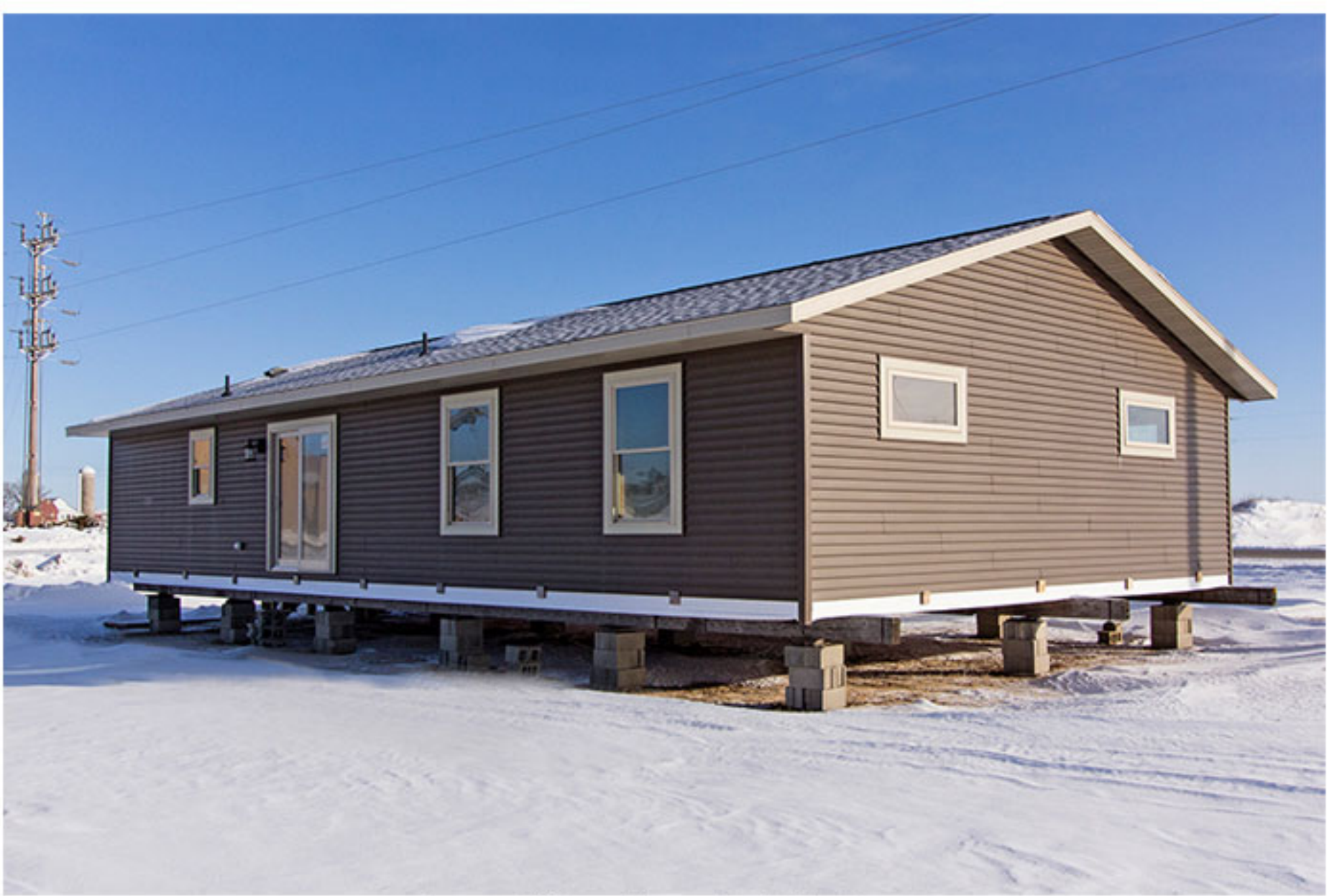
Energy Efficient Thermo-Tech Windows