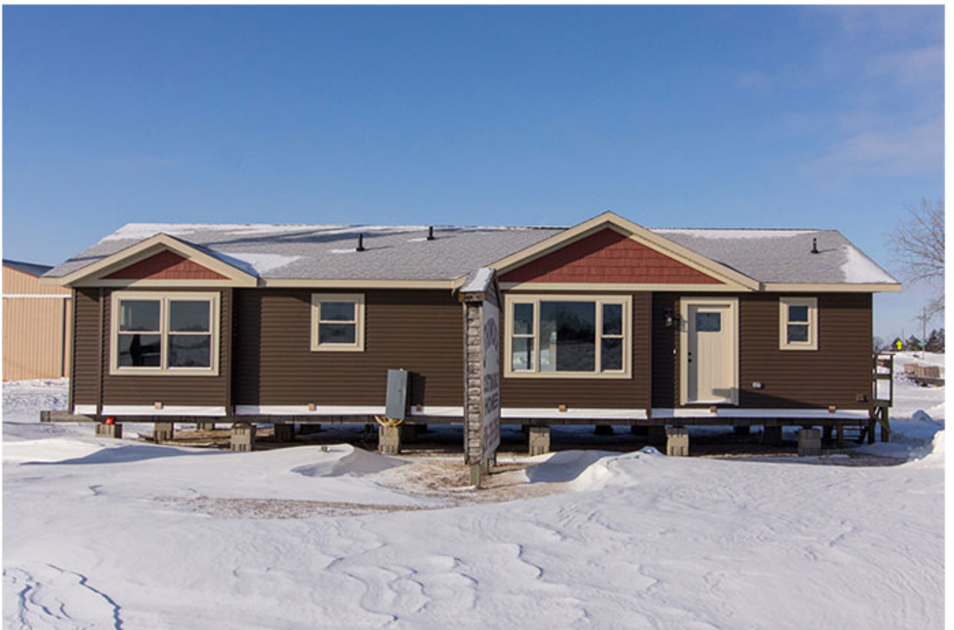
This easy living plan has 3 bedrooms including master bath, 2.5 baths and laundry room.